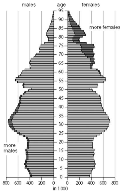
Germany's age distribution in 1995